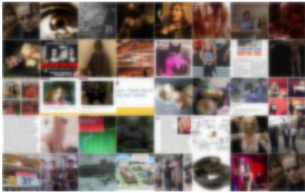
(a) High level of depression and anxiety